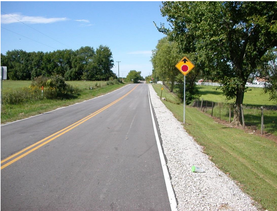
Typical eastern Kansas road improved with federal aid (now paved), note the right-of-way is 60 feet or less, and the grade just follows the adjacent land.

So, what do we do if a land owner questions the right-of-way along a road and we can't find the records? That has to be decided on a case by case basis based on the situation. I don't think it would be right to just give the land back if there are utilities located there, or if the land is needed to maintain a proper road. Whether we have records or not we should be exercising due care over our apparent right-of-way by keeping it free from traffic hazards, mowing as necessary and cleaning ditches for drainage. If we exercise control over our right-of-way land owners will not start thinking it belongs to them, and the lack of records will not become an issue.