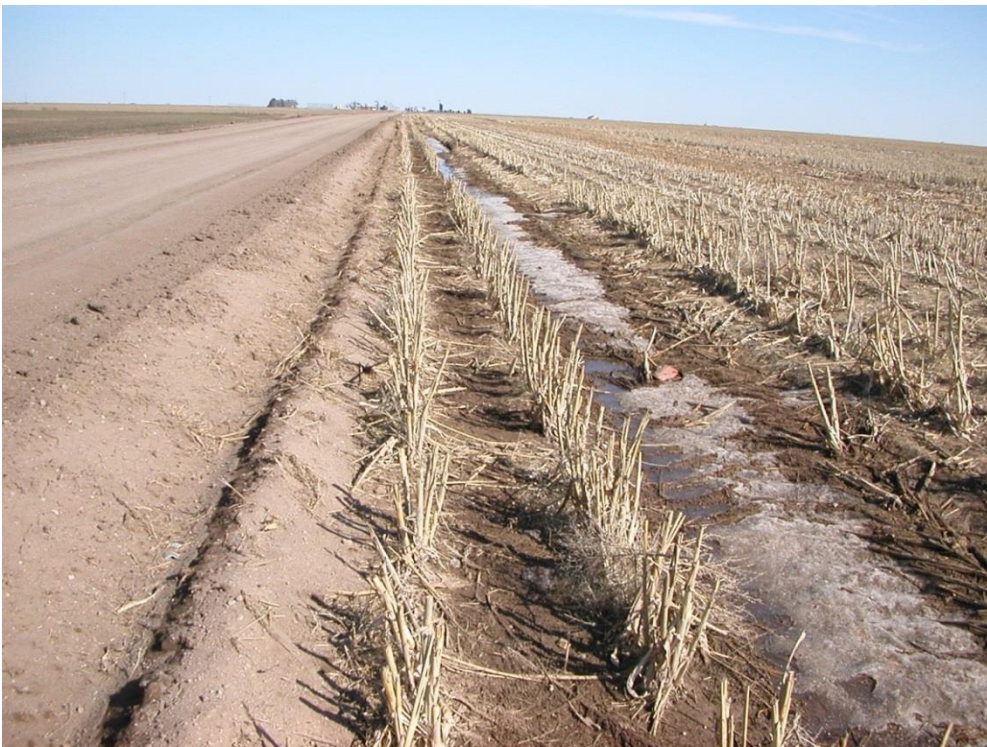
Federal aid route where land owner has farmed up to edge of the road and widened right-of-way is no longer obvious.