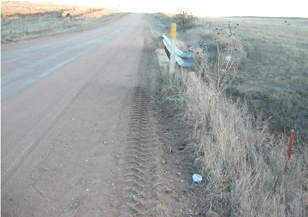
Typical western Kansas road improved with federal aid, note that the right-of-way appears to be about 80 feet and the grade just follows the adjacent land.